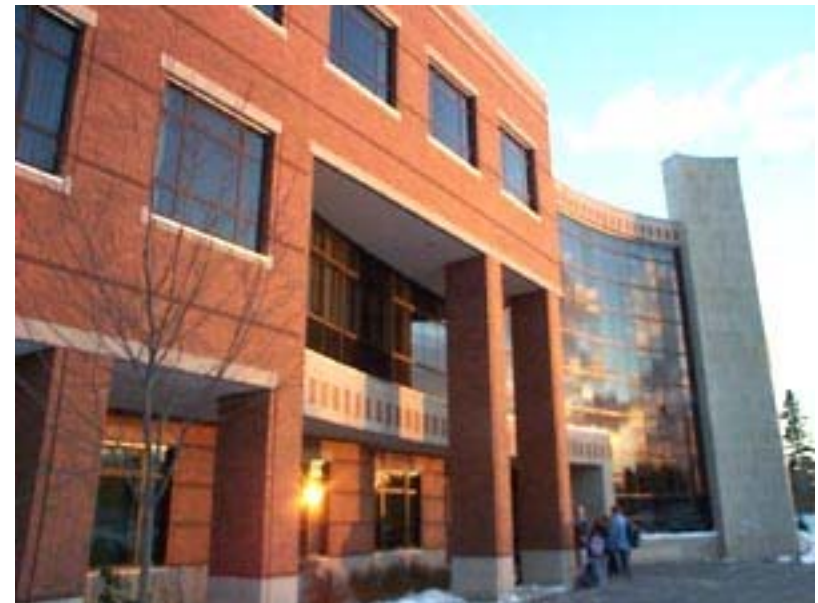
All Saint Catholic School

The original Kanata is now known as the neighbourhood of Beaverbrook. In 1978, it was amalgamated with the older communities of Hazeldean, Glen Cairn and Rural March, and with the newer communities of Katimavik, Bridlewood, Marchwood-Lakeside, South March and Kanata Town Centre, to create the City of Kanata. This in turn was absorbed into an expanded City of Ottawa in 2001 (and is now called a community). The individual Kanata neighbourhoods have community associations which focus on communication, development and community spirit.